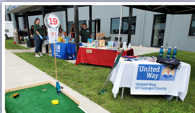
Page Trucking's Inaugural Touch-A-Truck event where Team Nucor grilled up a picnic lunch and United Way volunteers hosted a golf hole and sold raffle tickets