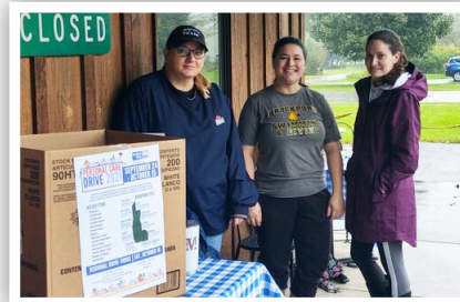
Photo: Volunteers from Elmira Savings Bank at Moravia drive-thru event

This year's drive launched at Kickoff on September 24th and ended on October 16th collecting 4,490 items between 30 participating locations and four regional drive-thru events. The Food Providers Network distributed the items to 17 Cayuga County food pantries, soup kitchens, and shelters.